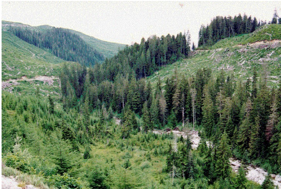
Photo of Chapman Creek at mid valley, showing isolated islands of forest amid a denuded landscape. The watershed is scarred with a network of logging roads and numerous landslides.

remains in the Chapman Creek drainage is odd, particularly after hearing Mr. McCracken state in his opening remarks that the primary goal of his Ministry was to protect the water supply.