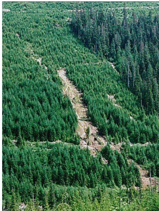
Chapman Creek watershed. One of hundreds of landslides from forestry practices. Chapman Creek channel at bottom of photo.

4.0 - In the absence of other forms of funding the forest licensee or range tenure holder will be required to post bonds to cover, in whole or in part, the costs of remedial action to water supplies and water delivery systems required during the term of the forest licence cutting authority, or range tenure document. In the case of the forest license and cutting authority this provision will extend past the term of the license to include the period of time required for the next crop of trees to reach the “free growing” stage. (Ministry Of Forests Policy, 3rd Draft Proposal, Integrated Resources Branch, December 18, 1989)