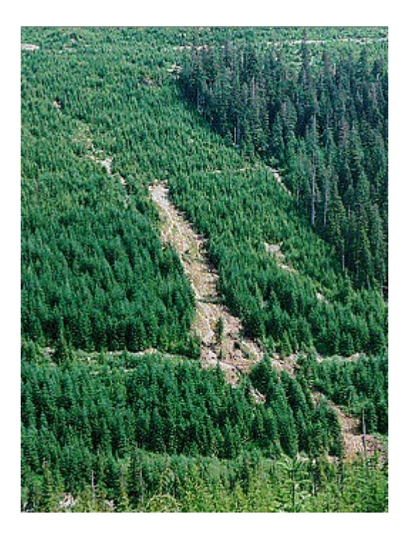
Chapman Creek watershed. One of hundreds of landslides from forestry practices. Chapman Creek channel at bottom of photo.

The Ministry of Environment, Lands, and Parks, as the landlord agency of B.C.'s Watershed Reserves, needs to be honest about all the available options for protection of water supplies, not only for the SCRD, but for all water supply users.