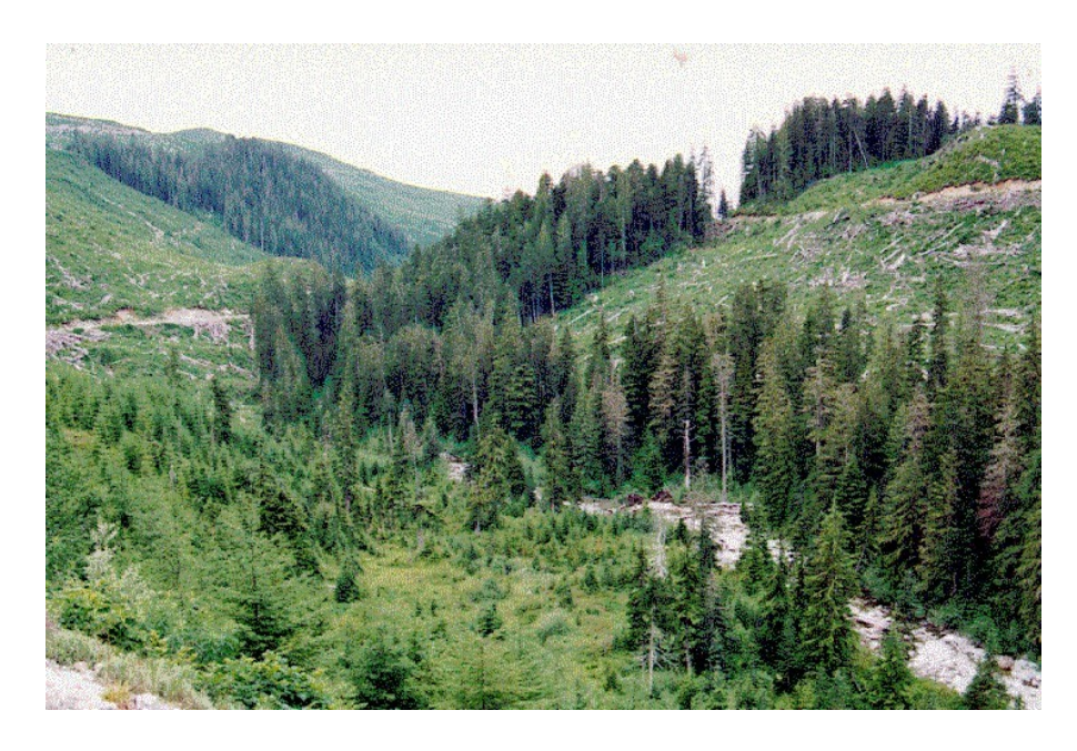
Photo of Chapman Creek at mid valley, showing isolated islands of forest amid a denuded landscape. The watershed is scarred with a network of logging roads and numerous landslides.

remains in the Chapman Creek drainage is odd, particularly after hearing Mr. McCracken state in his opening remarks that the primary goal of his Ministry was to protect the water supply.