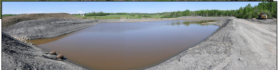
Encana’s new 22-well frack pad, and water source (two kilometres distant), south of Dawson City, near 200 Road, May 29, 2017.