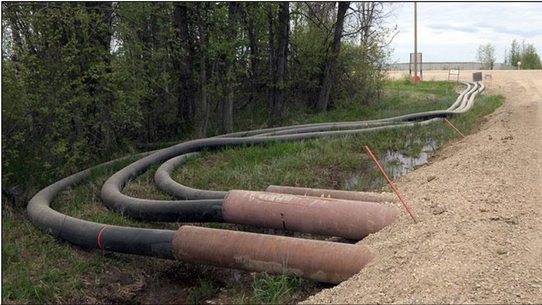
Three 10-inch pressurized fresh water diversion pipes, pumped from huge water pit (see below), running some 8 kilometers to Apache's frack pad, near Fox Creek, Alberta, May 22, 2017.