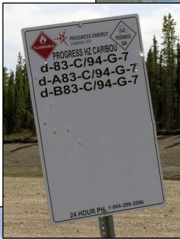
One of Progress Energy’s numerous cleared frack sites on Crown lands, with huge water dam, north of Ft. St. John, June 1, 2017.