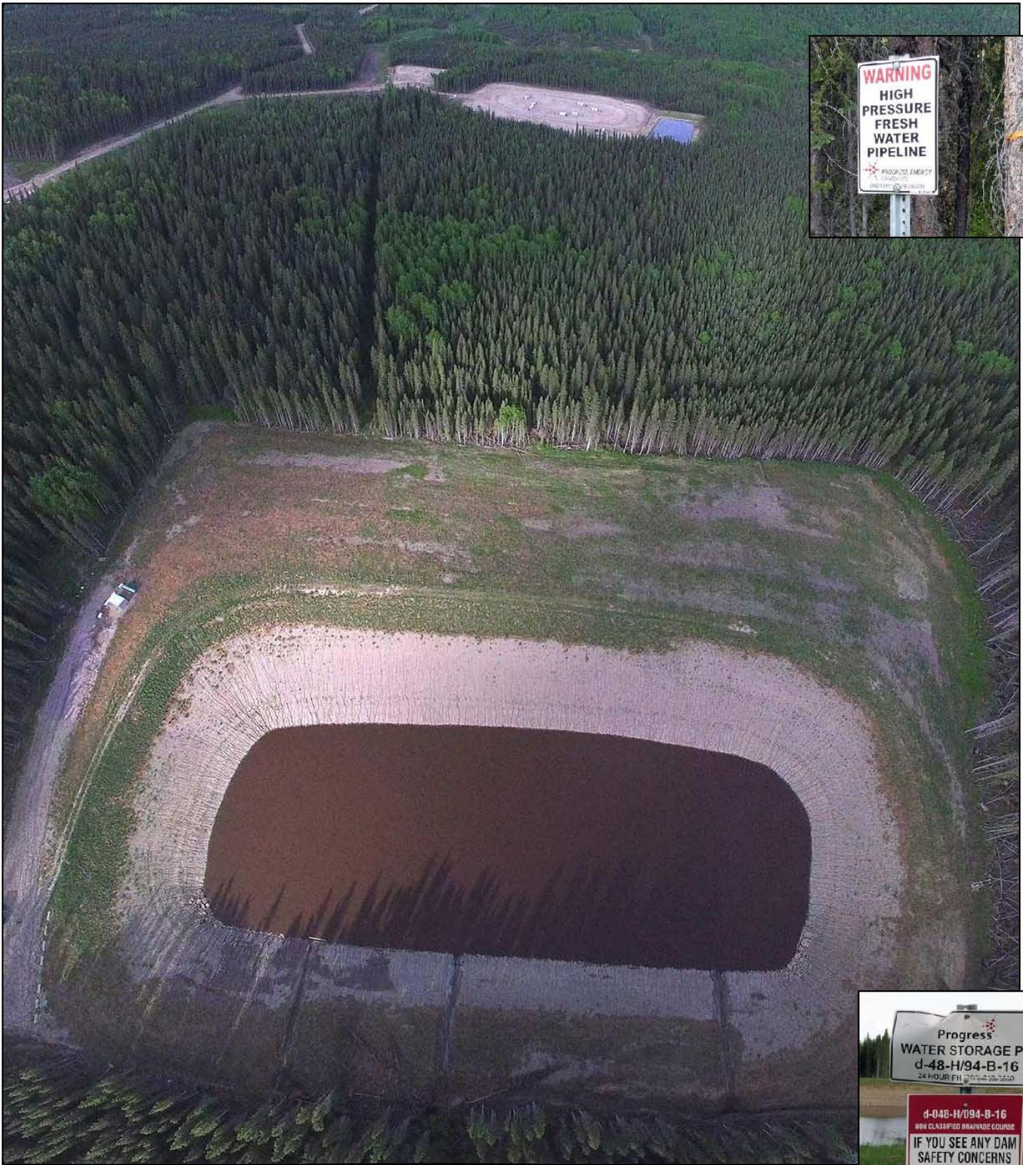
One of Progress Energy's 'water' dams, built without proper permits, located north of Ft. St. John, June 1, 2017.